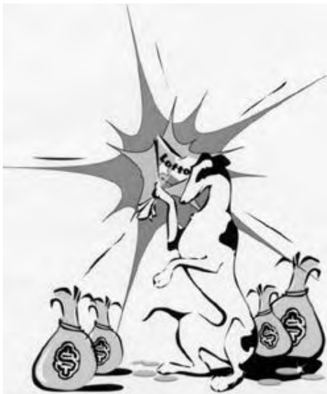
GPA Central Texas Pick a Winner Everytime!