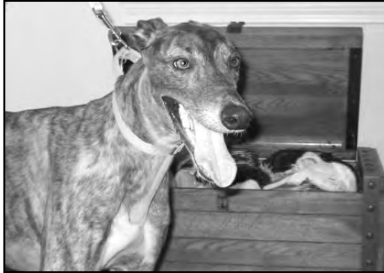
Champ II is a very special dog looking for a very special home.

So Champ II was surrendered to GPA/CT, with the idea that he would be reclaimed when his human finished school. She did finish school but did not reclaim him. He spent some months in a foster home with a lot of other dogs. He did not get along well with the other dogs, often barking and starting fights.