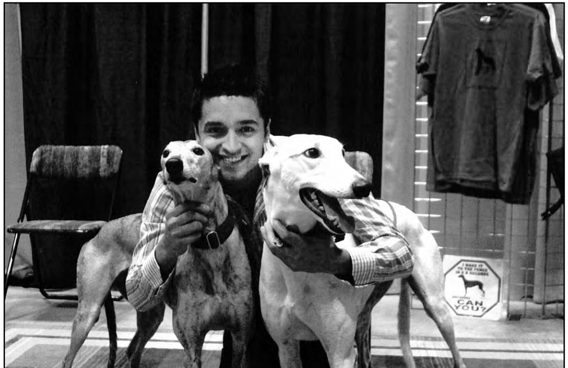
Jai Rodriguez, star of Bravo's "Queer Eye for the Straight Guy" lends celebrity to GPA-CT.