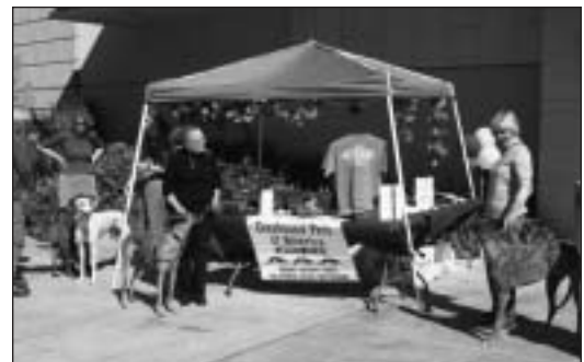
The GPA-Central Texas booth was located in front of Neiman-Marcus.