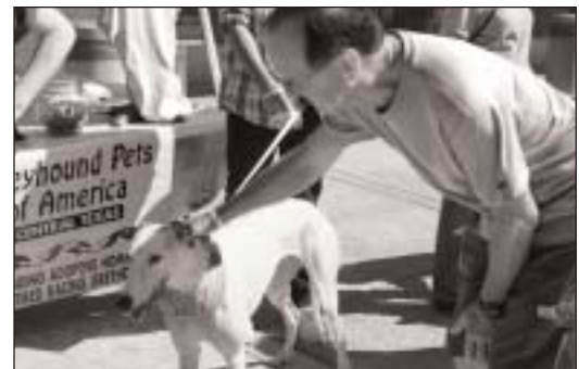
Foster dog Ahlia attracted lots of attention from Dogtoberfest visitors.